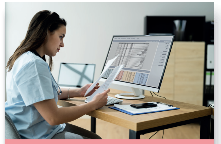
Data Analyst Uses analytics tools and datasets to support the costing team with generating insight